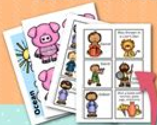
End of Lesson Games