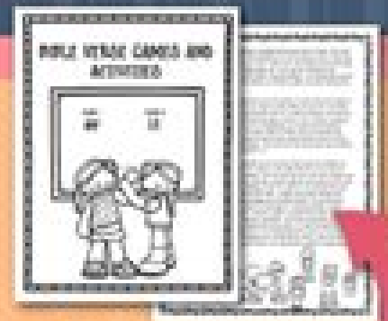
Bible Memory Activities