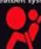
Airbag and seatbelt system