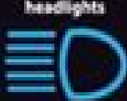
Main beam headlights