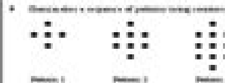
Fig. 1 Complete the table