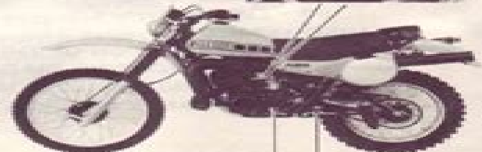
Shift pedal Ratcheting type 6-speed transmission (TT250G)