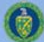
Department of Energy