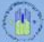
Department of Housing and Urban Development