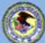
Department of Justice