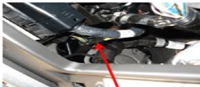
Four Blunt Cut Wires (Figure 1)