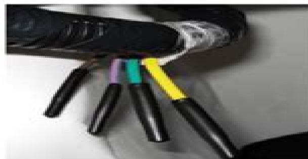
Four Blunt Cut Wires (Figure 2)