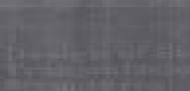
Fig. 1. Bridge structure