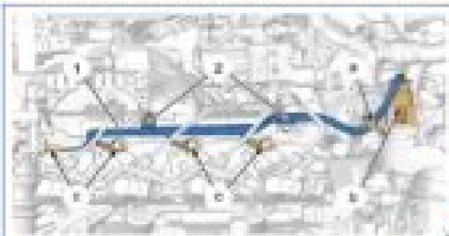
Figure 1: Engine Disconnect the battery (1). Disconnect the alternator (2). Disconnect the starter (3). Disconnect the battery (4). Disconnect the battery (5). Disconnect the battery (6).