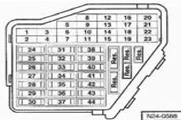
Table a. Fuse identification