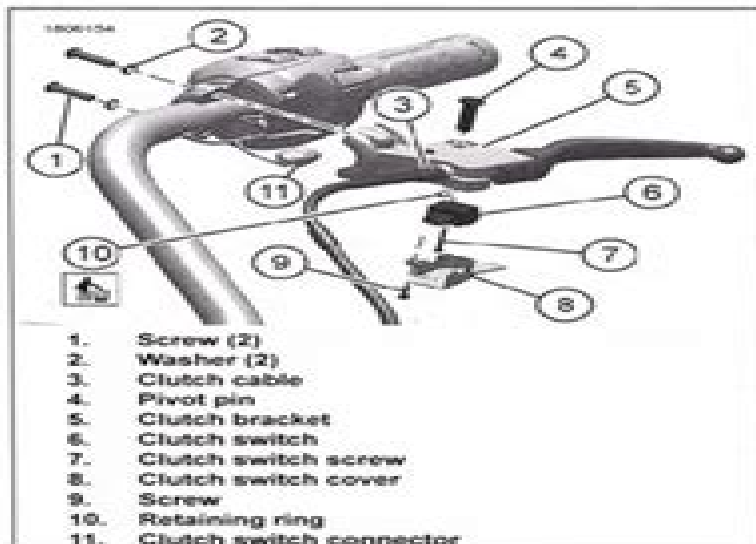
Figure 3-93. Clutch Lever Mount