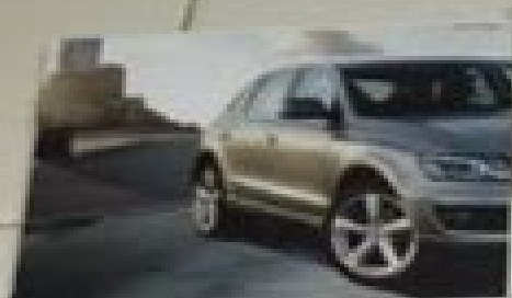
2011 Audi Q5 Quick Reference Guide