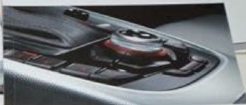
MMI Navigation plus Operating Instructions