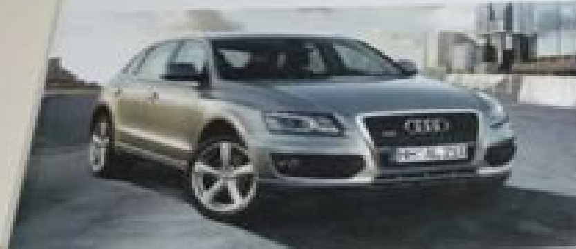
2011 Audi Q5 Owner's Manual