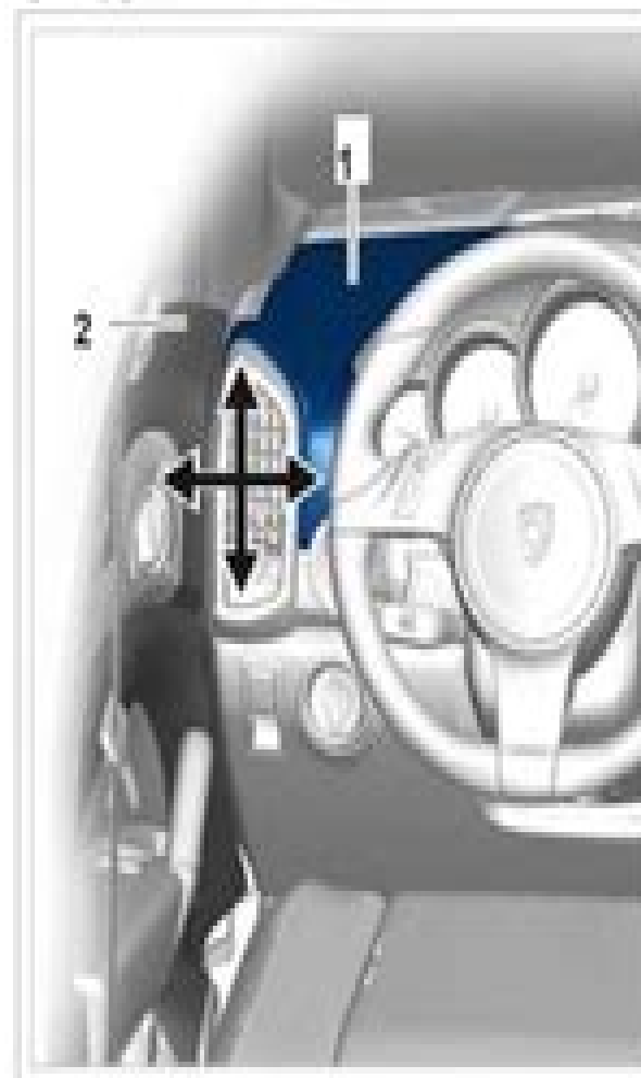
Fig 3: Identifying Gap Dimension Between Dashboard And Door Panel