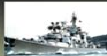
ILLUSTRATED BY PAUL WRIGHT