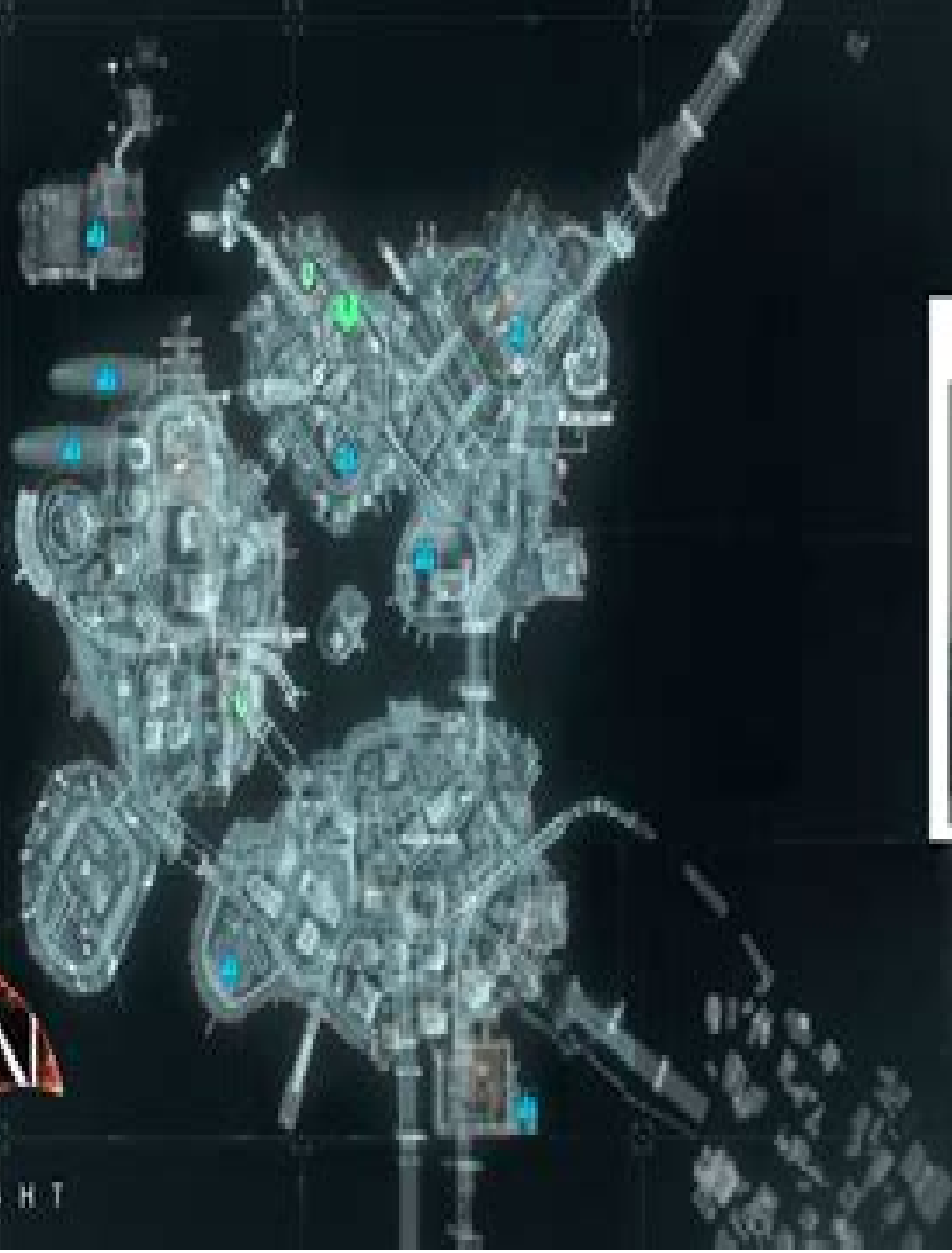
Arkham City: (To scale with Arkham Knight map)