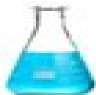
Preservatives and Artificial Flavors