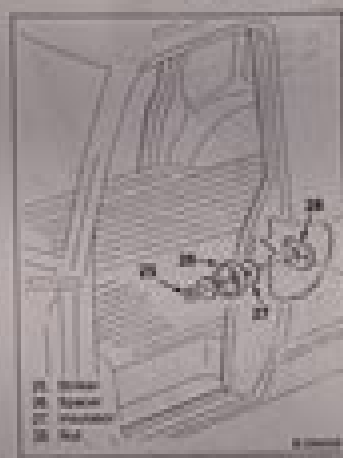
Figure 7—Lock Striker Components

Push from the window down the top of the door to the other side of the window. This is to move the window in position when the regulator is removed.