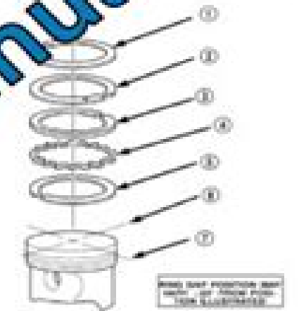
Fig. 42 Ring Gap Orientation