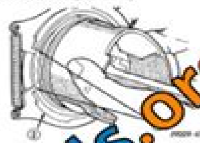
Fig. 41 Piston Ring Removal 1 - Compression ring 2 - Oil control ring 3 - No. 1 Piston Ring - Cap 100° from No. 2