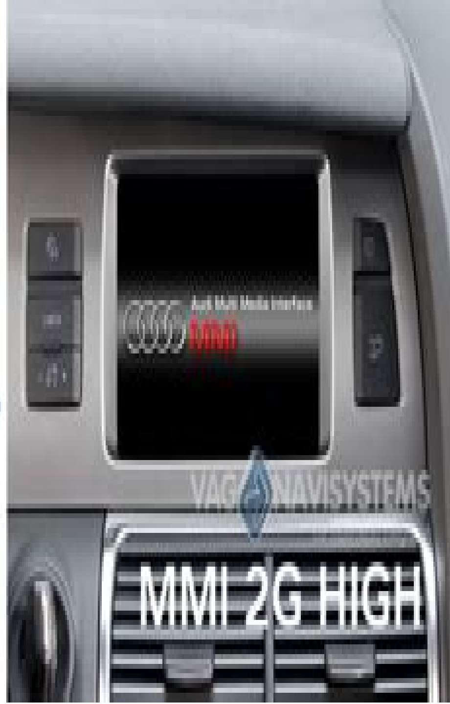
MMI 2G HIGH