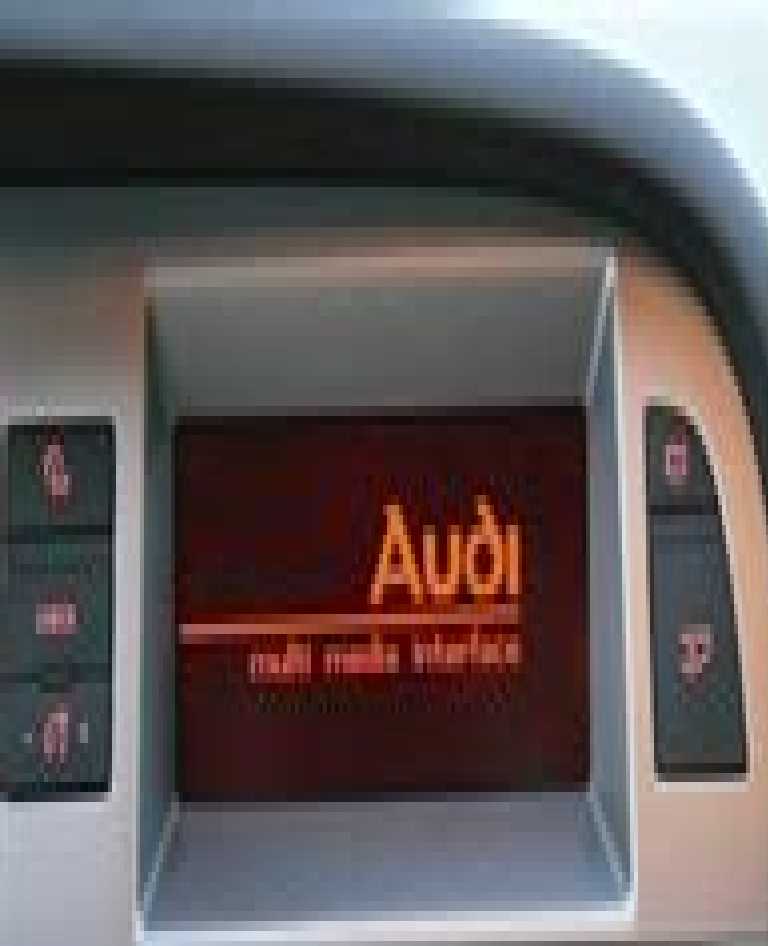
MMI 2G BASIC