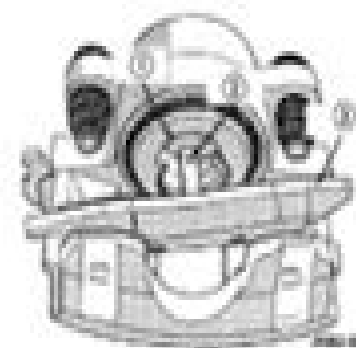
Fig. 29 Drum Brake

NOTE: If original brake shoes will be used, keep them in same left and right. They are not interchangeable.