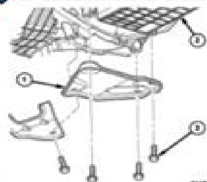
Fig. 3 Old Power Transfer Unit