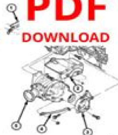
Fig. 4 Power Transfer Unit Mounting