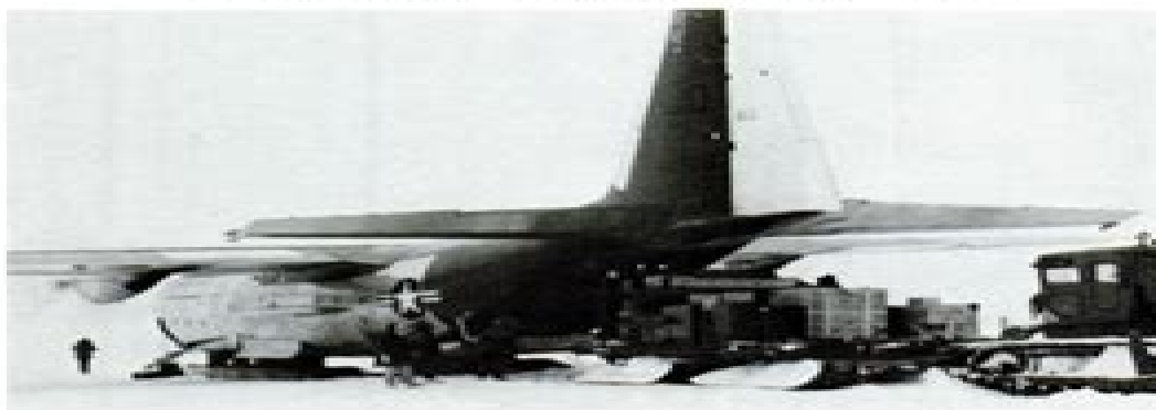
Ski-equipped Hercules changing the face of icebound outposts.