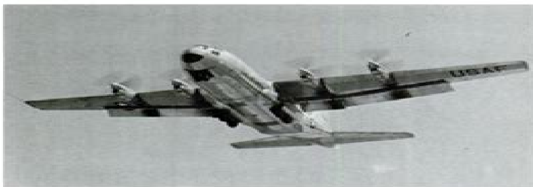
An early "A" model—note the Jimminy Cricket nose.