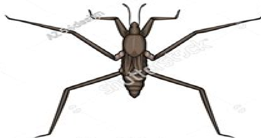
Pond Skater (Gerridae)