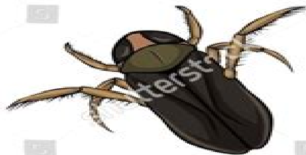
Water Boatman (Corixidae)