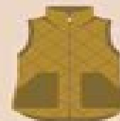
Clothing & accessories