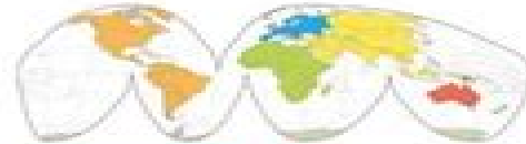
2. Goode's Equal-Area