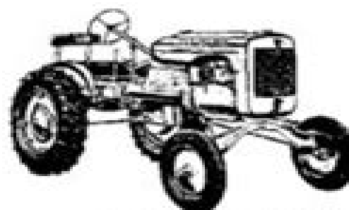
ALLIS-CHALMERS MODEL "B"

Allis-Chalmers Mfg. Co. TRACTOR DIVISION MILWAUKEE, WISCONSIN U. S. A.