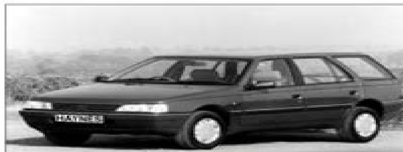
Peugeot 405 GL Estate