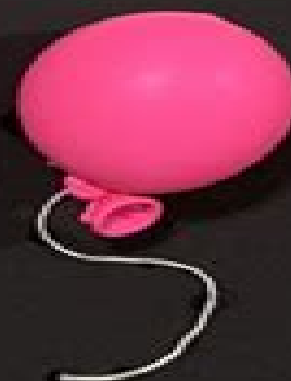
Air in the balloon