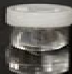
Water in the container