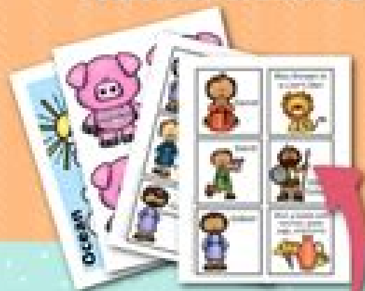
End of Lesson Games