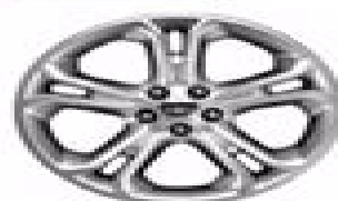
20" Painted Aluminum Standard