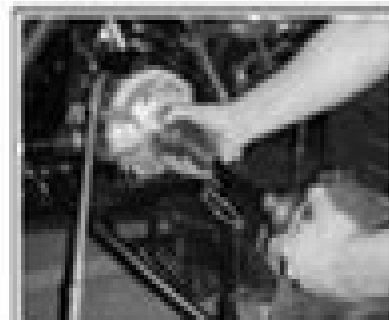
Figure 3 1. Pull drive shaft

Strongly pull drive shaft out of differential.