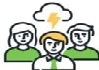
Find a Study Buddy