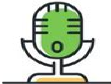
Listen to Podcasts