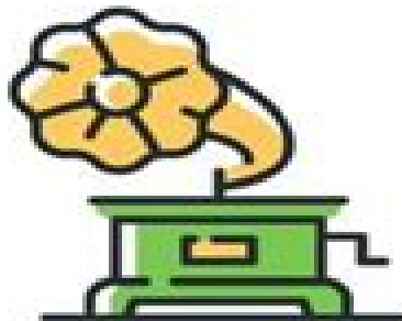
Learn through Music