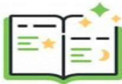
Read Out Loud