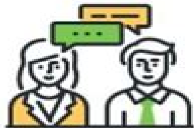
Discussion and Debate