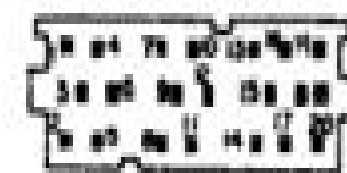
CN781-C 20Pin Connector