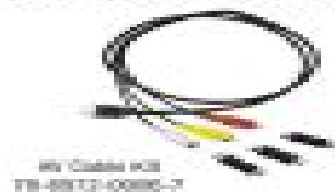
AV Cable Kit 78-6012-0000-7