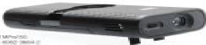
3M MPro150 38-6042-0000-2