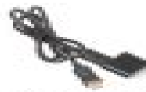
Cable for Apple® products (iPod®, iPhone®, etc.) Optional 78-6012-0000-8