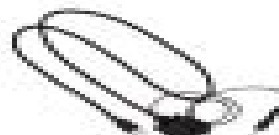
Computer Cable 78-6012-0001-5