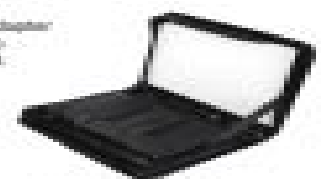
Presentation Binder Optional