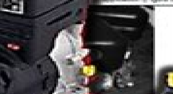
Figure 27: Diagram showing the connection of the battery to the engine's electrical system, including the alternator and starter motor.

NOTE: Some original equipment manufacturers