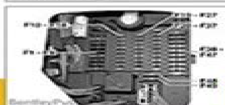
Comprehensive fuse, relay, and electrical component locations, ECU Electrical Component Locations