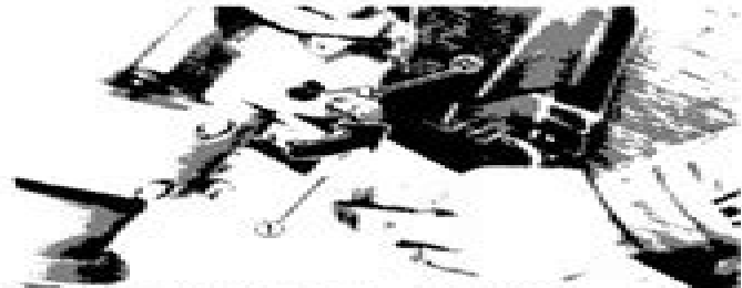
1. Shallow water drive lever