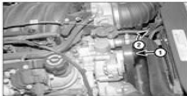
24.11 To remove the drivebelt, rotate the tensioner bolt (1), clockwise (2) to relieve belt tension (2007)