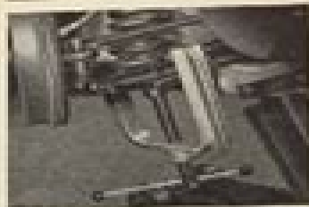
FIG. 1.1. Illustration of the two main types of computer networks: local area networks (LANs) and wide area networks (WANs).