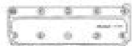
Fig. 13. Cylinder head and igniting plug.