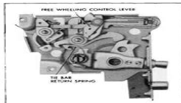
Fig. 36—Door Lock Assembly

ing tool. Bear this fact in mind, for it may be used as a guard against pulling off the tie bar return spring (fig. 36).