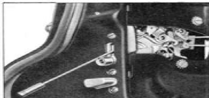
Fig. 34—Adapting Lock to "Free-Wheeling"

To adapt the door lock to "free-wheeling" it is necessary to insert an adjusting tool through the lock bolt slot in door pillar facing, engage the control lever, and trip the lever away from the door facing (fig. 34). When the control lever is in this position and the door lock button "down" (door locked), the inside remote control handle will "free wheel". If the lock button is "up" (door unlocked), the inside remote control handle will not "free wheel" but will operate the door lock.