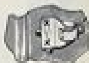
Figure No. 124 Rail and corner of a seat construction of seat back.