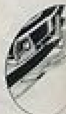
Figure No. 126 Front seat metal rail and frame assembly.