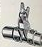
Figure No. 123 Seat back spring wire for building seat backrest and sections of seat base.