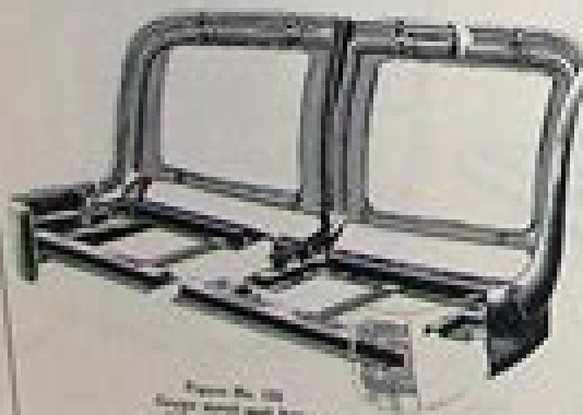
Figure No. 125 Section front seat metal rail frame and spring seat back.