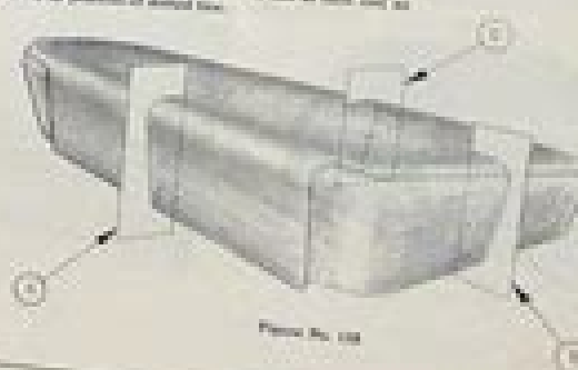
Figure No. 128