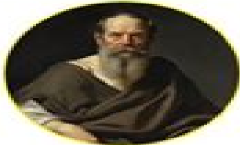
FATHER OF HISTORY HERODOTUS