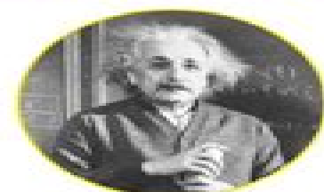
FATHER OF PHYSICS ALBERT EINSTEIN