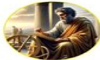
FATHER OF GEOMETRY EUCLID