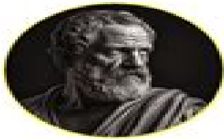
FATHER OF BIOLOGY ARISTOTLE