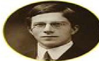
FATHER OF STATISTICS RONALD FISHER