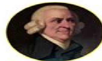
FATHER OF ECONOMICS ADAM SMITH