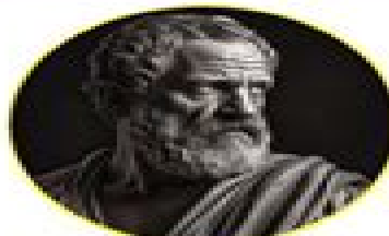
FATHER OF ZOOLOGY ARISTOTLE