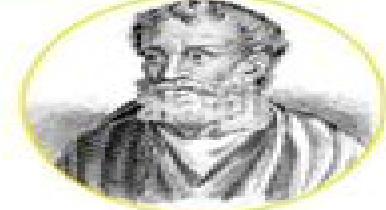
FATHER OF BOTANY THEOPHRASTUS