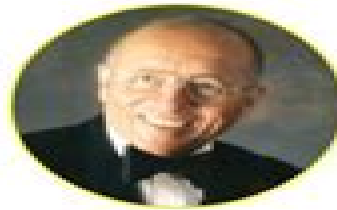
FATHER OF ROBOTICS ENGELBERGER