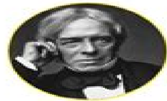
FATHER OF ELECTRONICS MICHAEL FARADAY