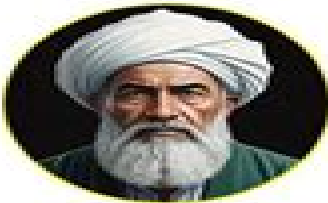
FATHER OF CHEMISTRY JABIR BIN HAYAN