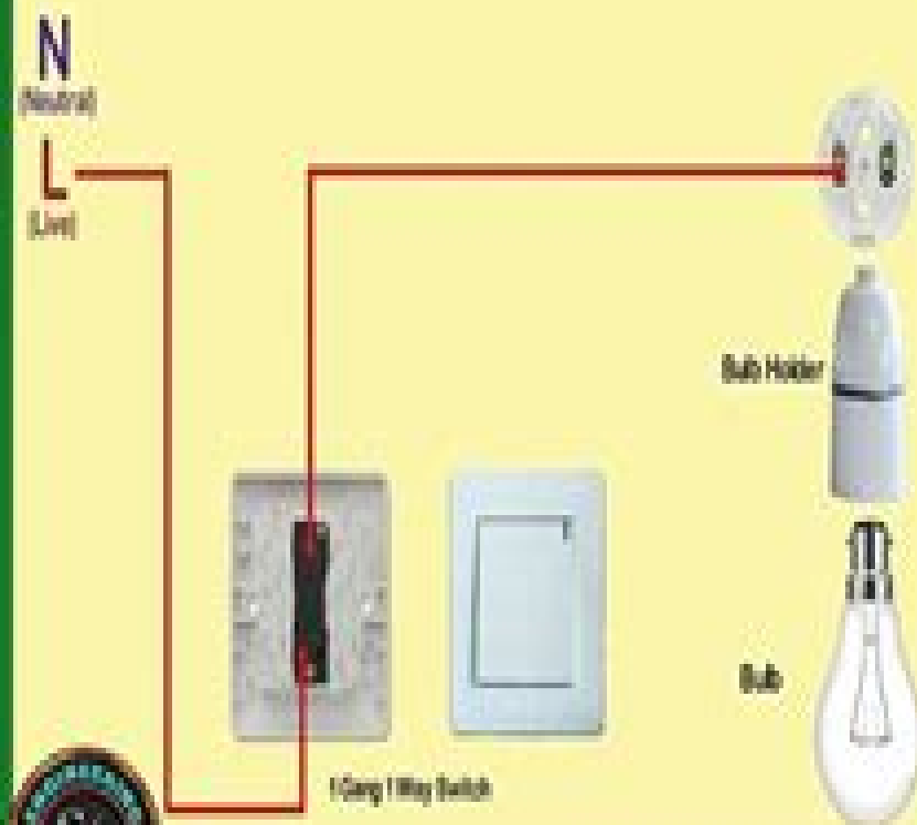
[01] 1 Gang 1 Way Switch Connection