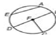
chord: \overline{AE} , \overline{BD} radius: \overline{FB} , \overline{FC} , \overline{FD} diameter: \overline{BD}