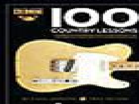
100 COUNTRY LESSONS (HL00696-433)