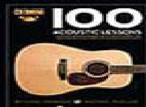
100 ACOUSTIC LESSONS (HL00696-434)

BE SURE TO CHECK OUT THE OTHER TITLES IN THE GUITAR LESSON GOLDMINE SERIES.