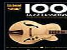
100 JAZZ LESSONS (HL00696-434)

Book $12.99, CD $6.00, CD $6.00 • Rk U.S. $24.99 Parts not sold separately