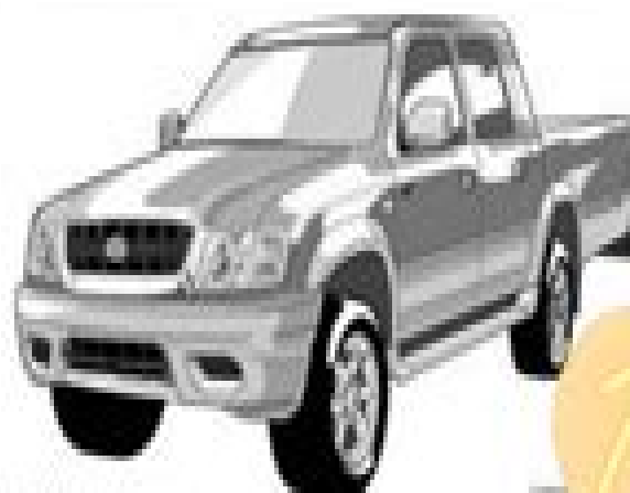
Marketing Skills and Team Manager