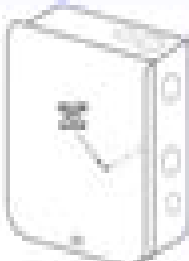
Securing the Cabinet Door

OPTIONAL KEY LOCK: If desired, a key lock can be installed (sold separately). See installation instructions for details.