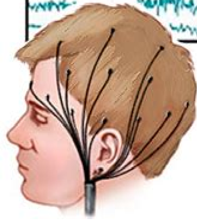
An electroencephalogram (EEG)