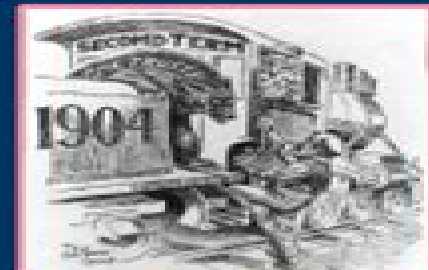
A 1903 political cartoon shows a bear symbolizing trusts threatening Teddy Roosevelt's chances at re-election.