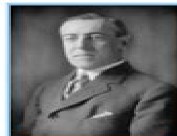
Woodrow Wilson led the United States through World War I, but failed to persuade the Senate to ratify the Treaty of Versailles.

After the war, Woodrow Wilson played a major role in negotiating the Treaty of Versailles . However, concerns about the League of Nations caused the treaty to fail in the Senate.