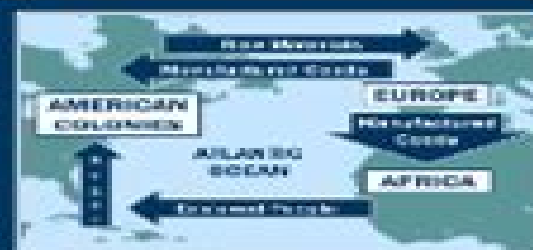
A map showing common Transatlantic trade routes during the colonial period.

In the 1650s, the British Parliament passed the Navigation Acts to regulate colonial trade and discourage British colonies from importing goods from foreign ports. Government regulation of trade to limit imports is known as mercantilism . However, the British government did not strictly enforce the Navigation Acts. This policy of nonenforcement is known as salutary neglect .